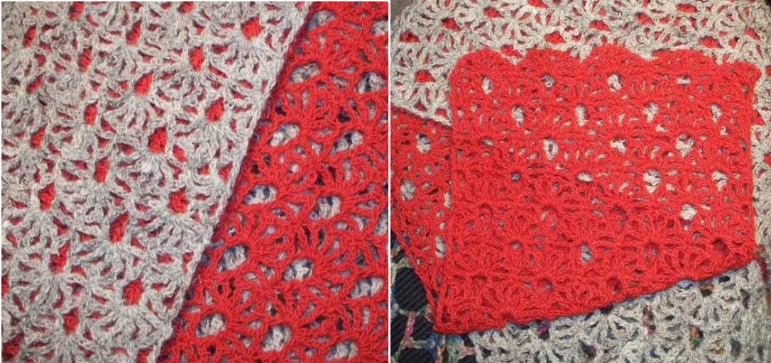
A two color version