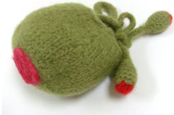
Knitted version with needle felted pimento and crocheted olive bolo tie (crochet instructions for bolo tie below)

Make purse into one giant olive by needle felting a large red circle on the very bottom of the purse.