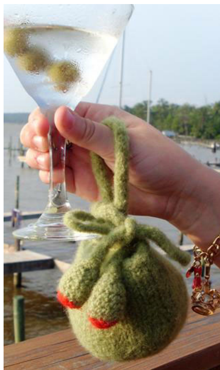
Tie bolo onto short handle

Weave in all ends & felt in washer as desired.