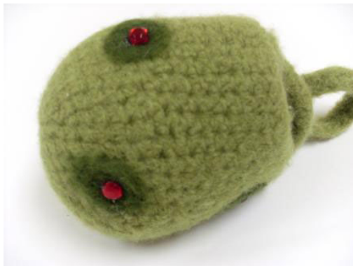
Needle felted olive with glued crystal pimentos

Need MORE glam? – make entire olives out of sequins by gluing strands of green sequins in an oval design. Finish off with a pretty crystal pimento.