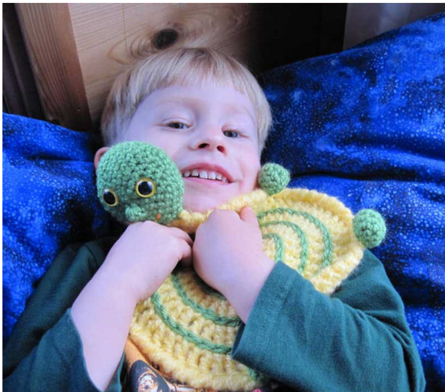
Kid tested, Mother approved