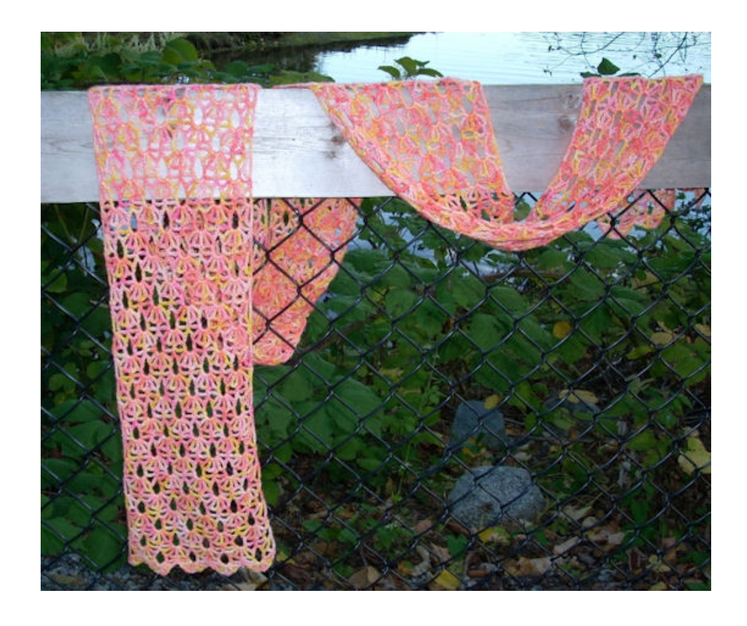
Pattern and photos of single color scarf © Tiffany Haworth, Joy of Life Photo of two color scarf © Stacie North Modeled by Ally English

Weave in ends. Wash and block as needed.