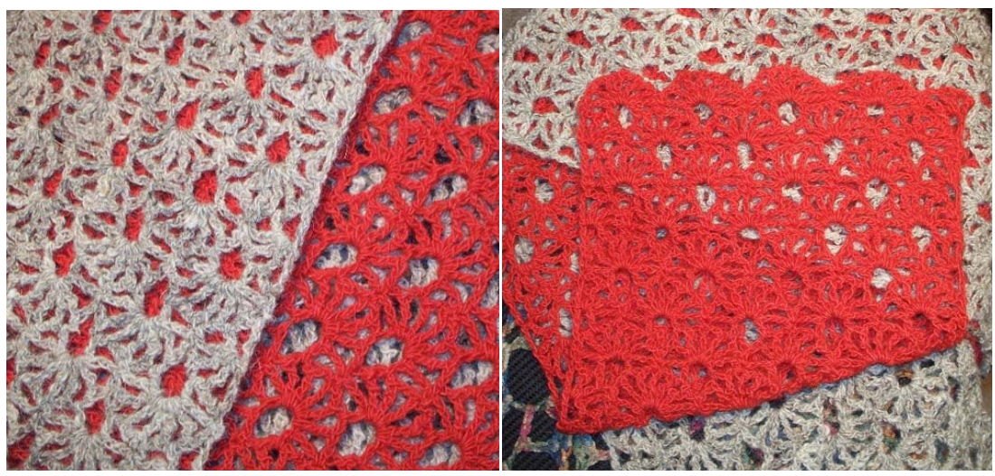
A two color version