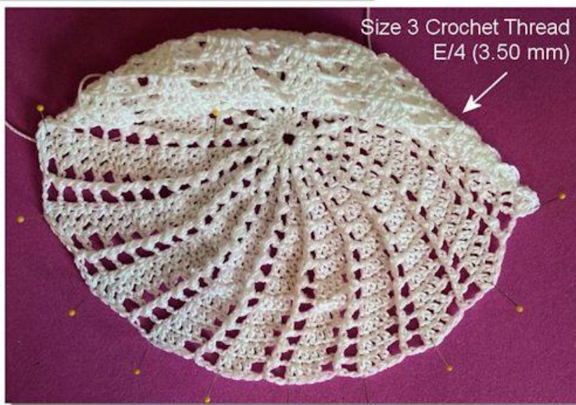
Size 3 Crochet Thread E/4 (3.50 mm)