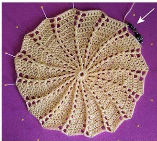
Size 5 Crochet Thread E/4 (3.50 mm)