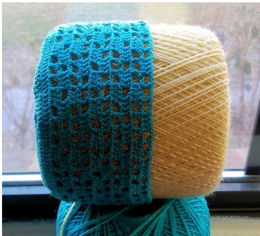
Start of bonnet using chart E

Weave in ends. Weave ribbon through the trc ch-2 sps of neck edging.